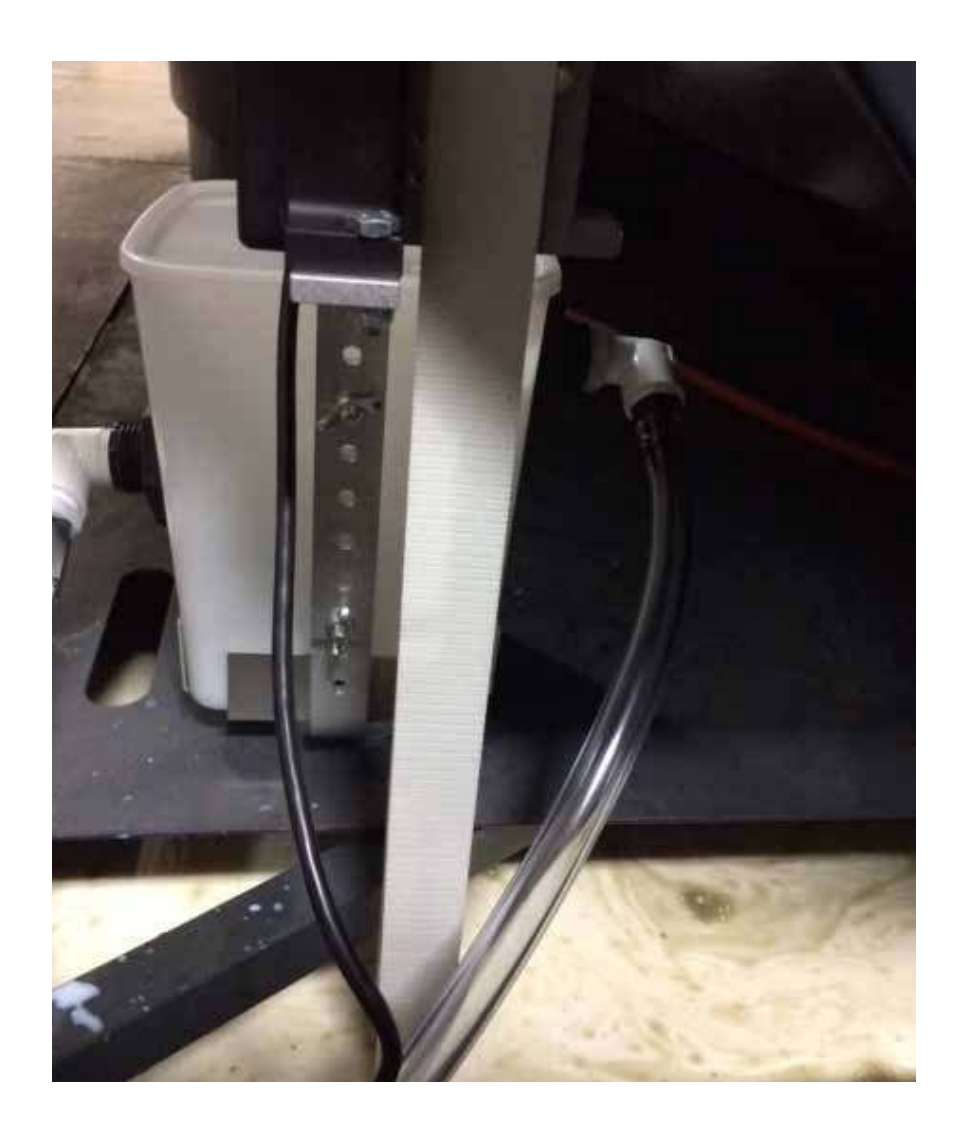
Clean Coolant Return to Sump