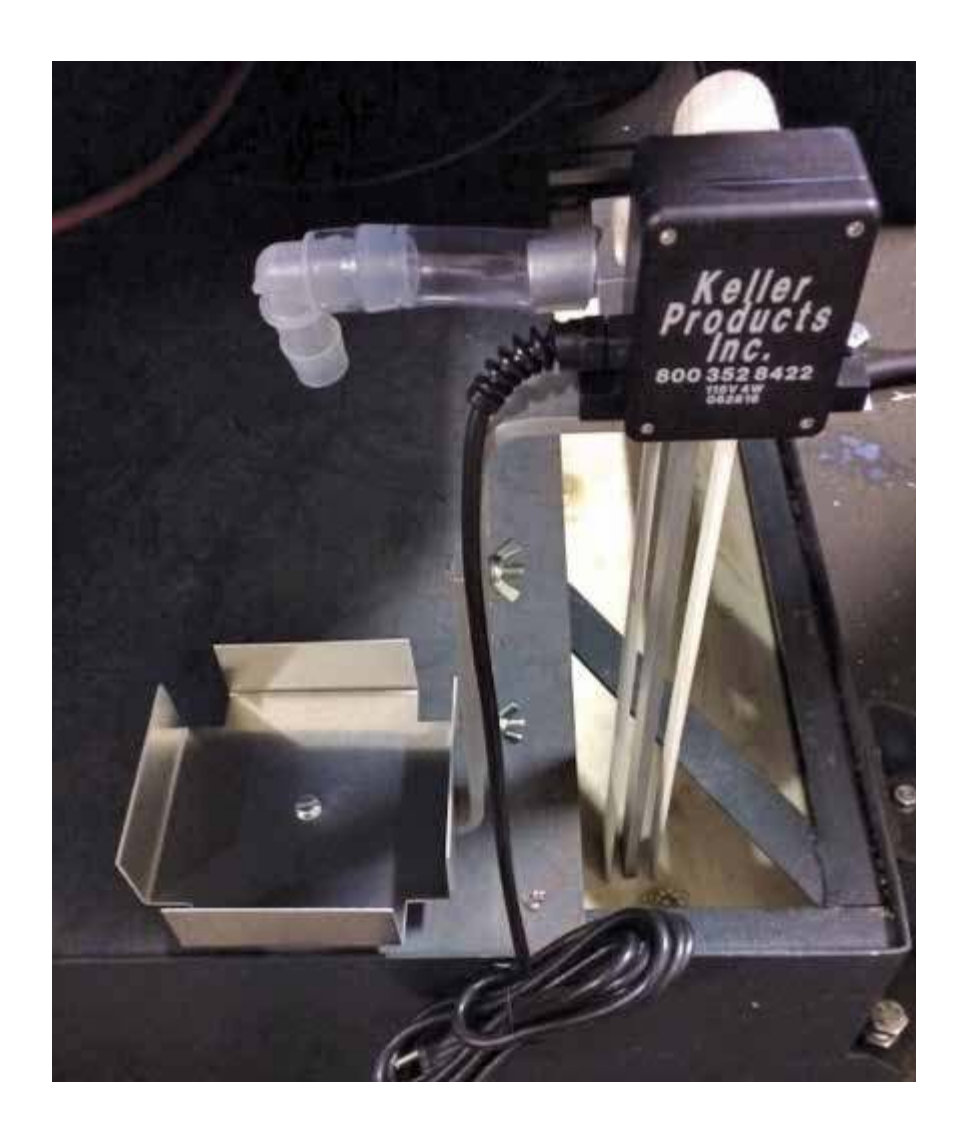
Place magnetic mount