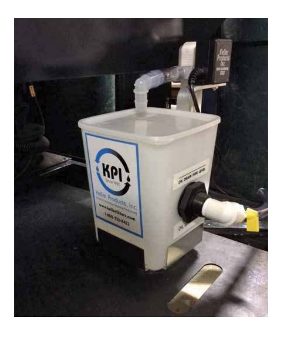
Plug in Motor