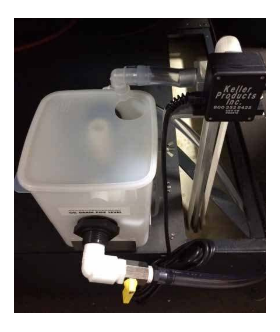
Place Skimallessor Tank in Bracket