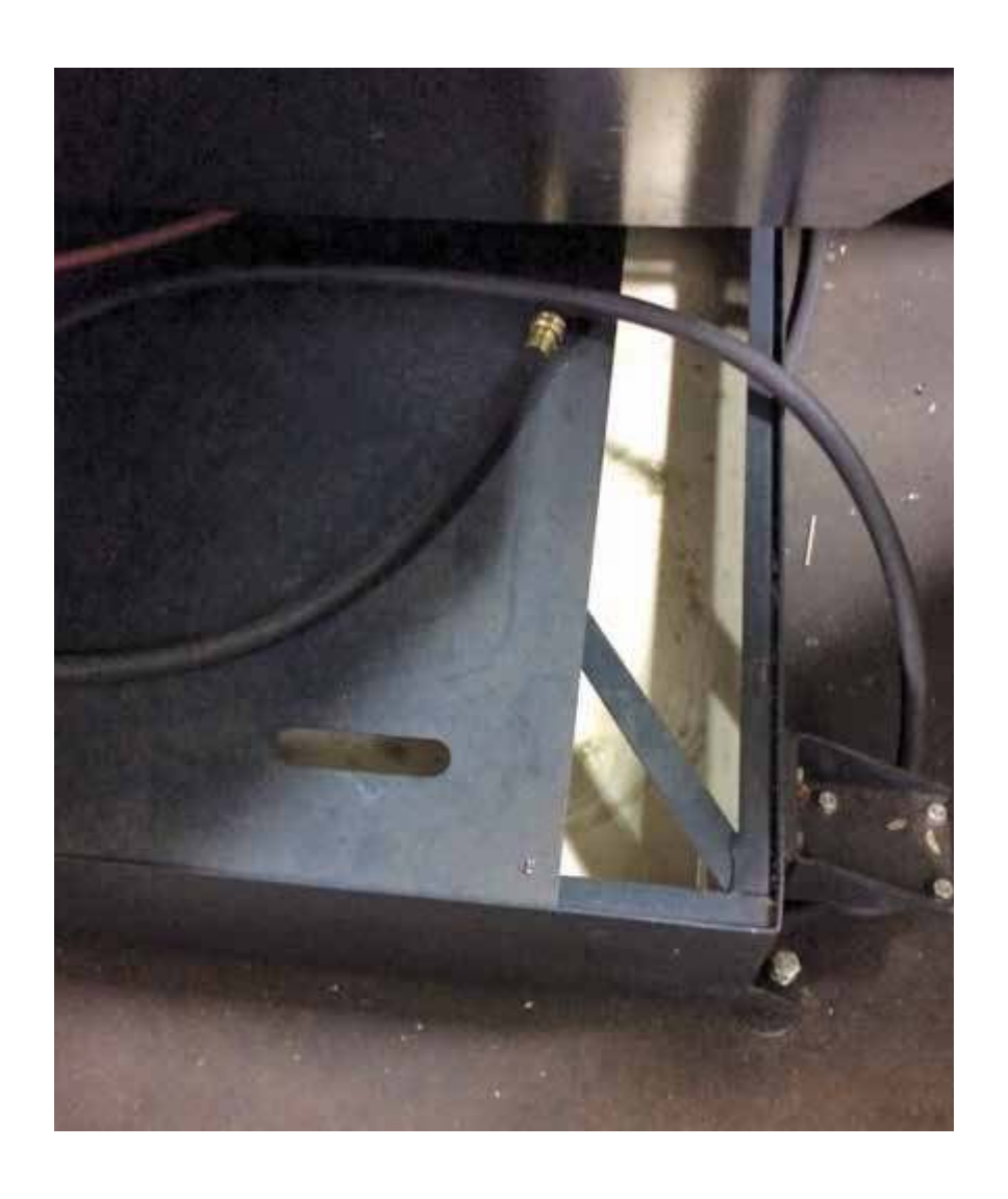
Identify a spot on machine tool for mounting