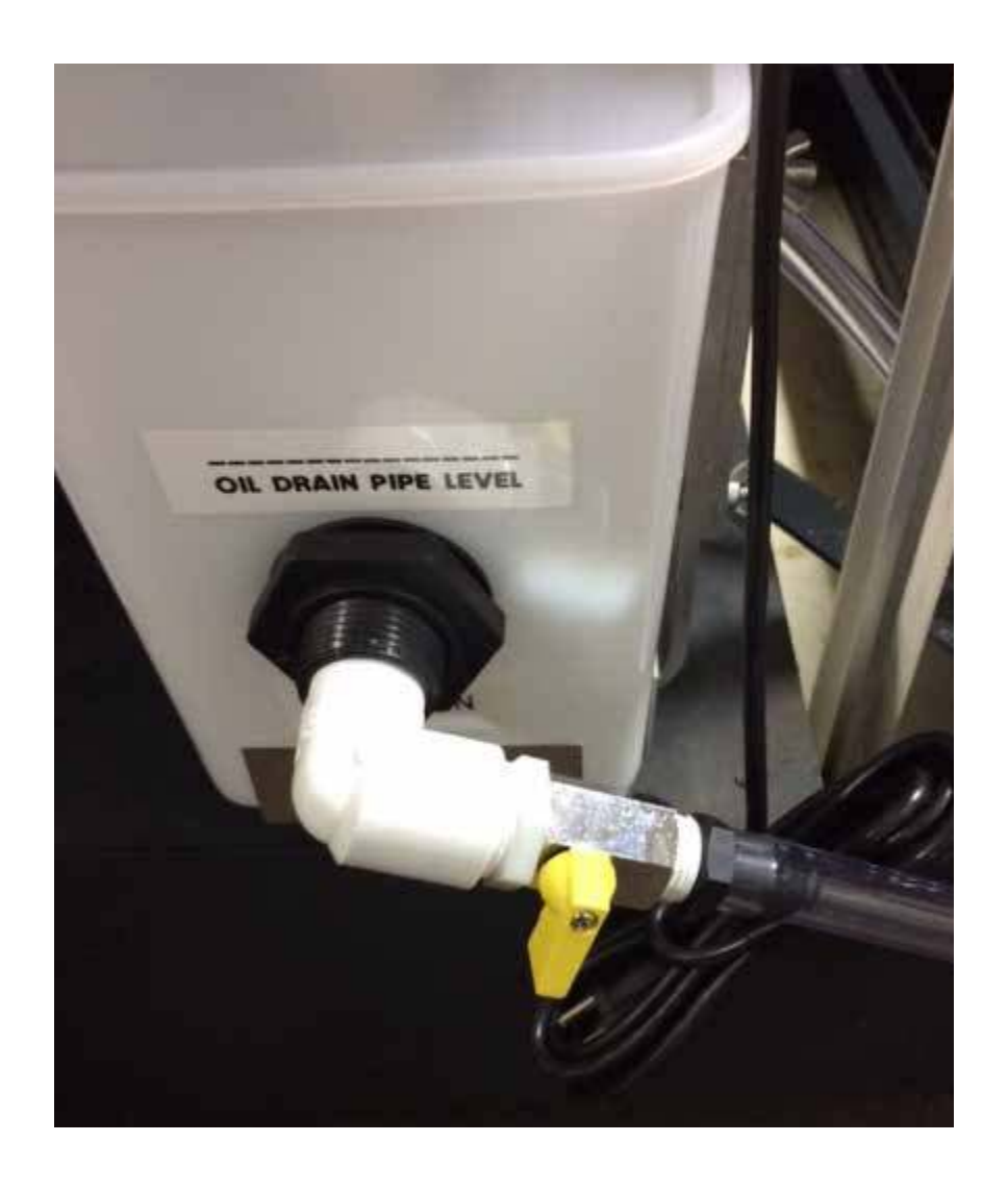
Attached Oil Drain Hose, Valve Closed