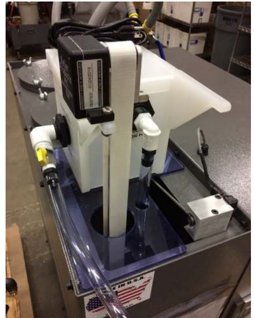
Keller Skimmer package fits directly onto MP system tank opening.